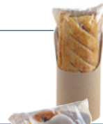
Single Wrap 564-60201 6 x 6 1/4"