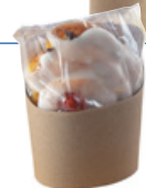
Double Wrap 564-60202 6 x 11"